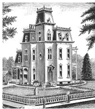
1875 O'Brien House

Consult Quitman Resource Center for Preservation, Rhinebeck Historical Society and Hudson River Heritage for more information.