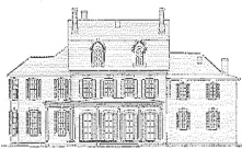
Wildercliff 1799 Gambrel roof Colonial