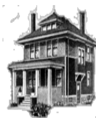
1921 "Castleton" Sears

You may conduct deed research on the second floor at the Dutchess County Clerk's Office, 22 Market Street, Poughkeepsie. Grantee (buyer) and Grantor (seller) indexes are located next to each other in the first aisle. Follow instructions at the beginning