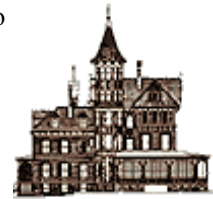
Wilderstein, 1888 Queen Anne Style

You may learn who built the house, when it was built, the style of the house, what it looked like originally and changes which have been made.