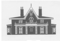
1844 Delamater House